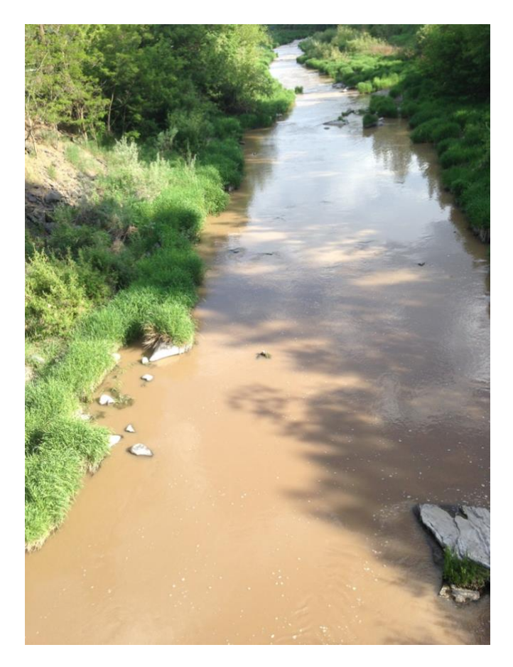
Sediment and soil (Pollution) in Hangman Creek, June of 2015